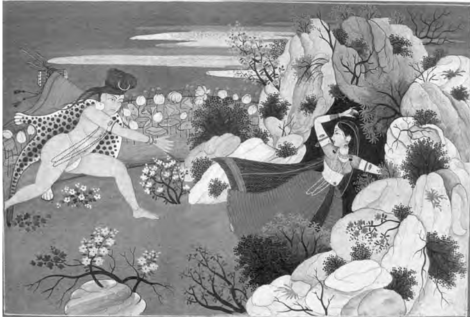
Figure 3 – Indian miniature painting

But they did colonize us and our art, and even how we ourselves perceive art today. They have inbred us to subjectify, genderise, personalize art and limit us to things, objects, sex, biology, gender. And this, in turn, has made us look at our own culture as the immoral Other, as inferior, barbarous, uncivilized, without aesthetics although laden with immoral pornography. The art of the Other, just as the difference of the Other, is held to belong to the natural landscape, but not to be art. The images, just as the native naked bodies, are judged on the grounds of morality, i.e., lack of cultural elevation, and hence as belonging to mere nature. After all, the very term "native" suggests that those so designated live merely naturally. Thus they even taught us to view our own art as indecent and naturally sexed and to consider European western art as superior.