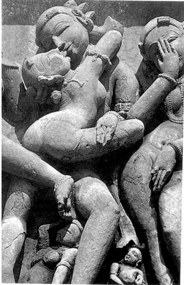
Figure 2 – Sculptures at Khajuraho

The British regarded these aesthetic images as indecent and obscene, and thus to be judged morally and not aesthetically. Once again, the significant aspect of this art, its cosmic nexus, the cosmic union, the cosmic aesthetics is excluded and thus inserted into an entirely different context. The way of looking at sexuality is perceived as something different, excessive, Other. These images are aestheticised thinghood, and the body is projected as nexus of exotic sexual fantasies about the Indian body. Approached as a textual system, the bodies point to an erotic, hypersexual aesthetic objectification of bodies as an idealized form of homogeneous type, thoroughly saturated with a totality of sexual predicates. The cosmic energies, which symbolize both creative and destructive forces, impinged on British imagination the wildest proclivities of India and the Indians. For the British, the Indians evidenced depravity and intimacy, the forces of darkness. The British viewed such imaginings of the cosmic energies as