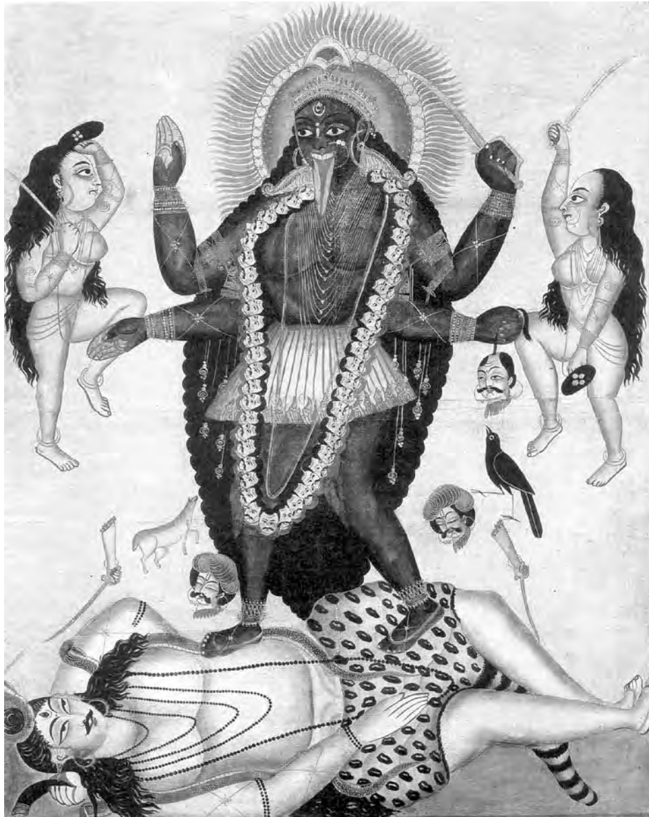
Figure 1 – Goddess Kali

symbolism of cosmic conceptions and not of representations of “proper” bodies. Kali was one form of shakti , power, force, symbolism and is encompassed within the Hindu mythology and aesthetics as the all-powerful saguna Brahman form. She is an image of matriarchal, maternal power, force, originator, adya shakti , the primal energy, cosmic energy world mother. Cosmic energy in its dynamic form is symbolized in the form of shakti , the world mother, who is power and energy by which the creation, preservation and destruction of the world, universe is portrayed in this all-encompassing form.